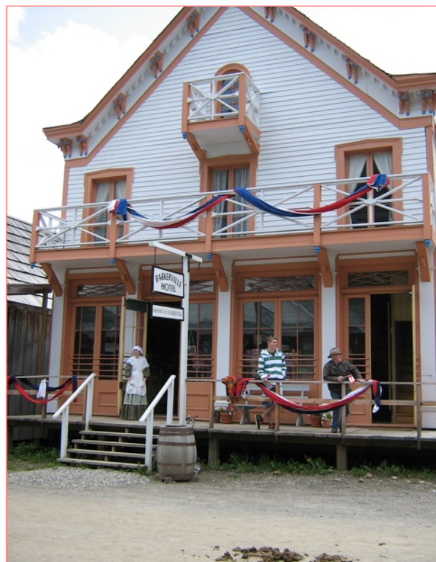
The Barkerville Hotel – all dressed up for Dominion day.

There is dancing in the streets, filming for television and movies and in general, good times being had by all who visit here in Barkerville.