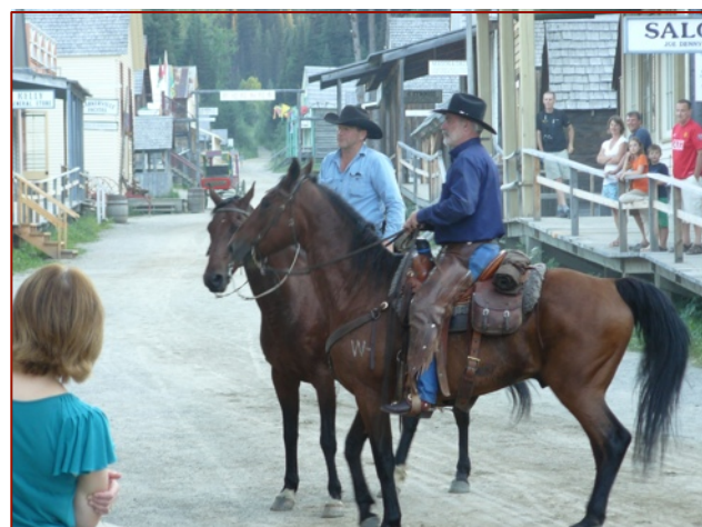
Mantracker – filming on Barkerville's Main Street